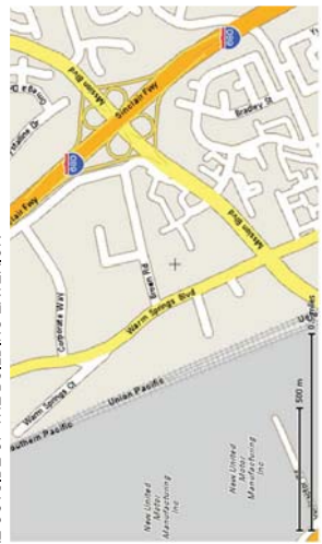
LOCATION MAP