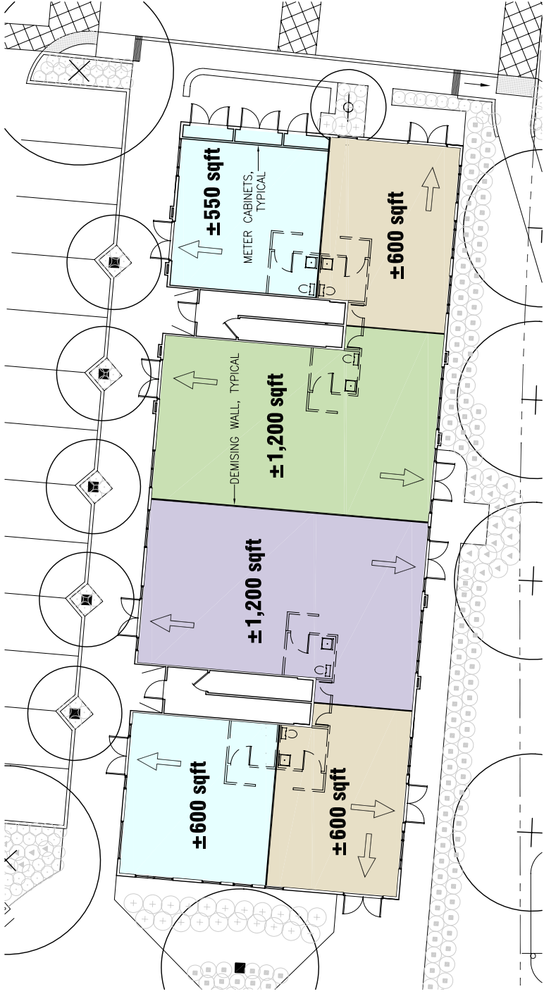
Typical Building Subdivision